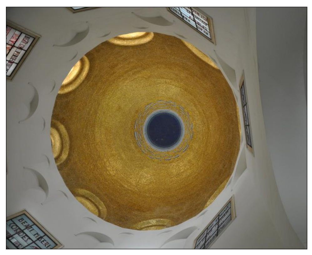
Beatitudes on the Eight Walls Beneath the Dome