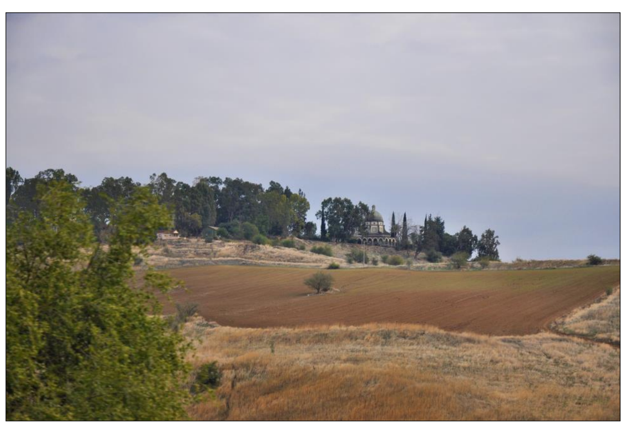
Hillside Below the Church of the Beatitudes