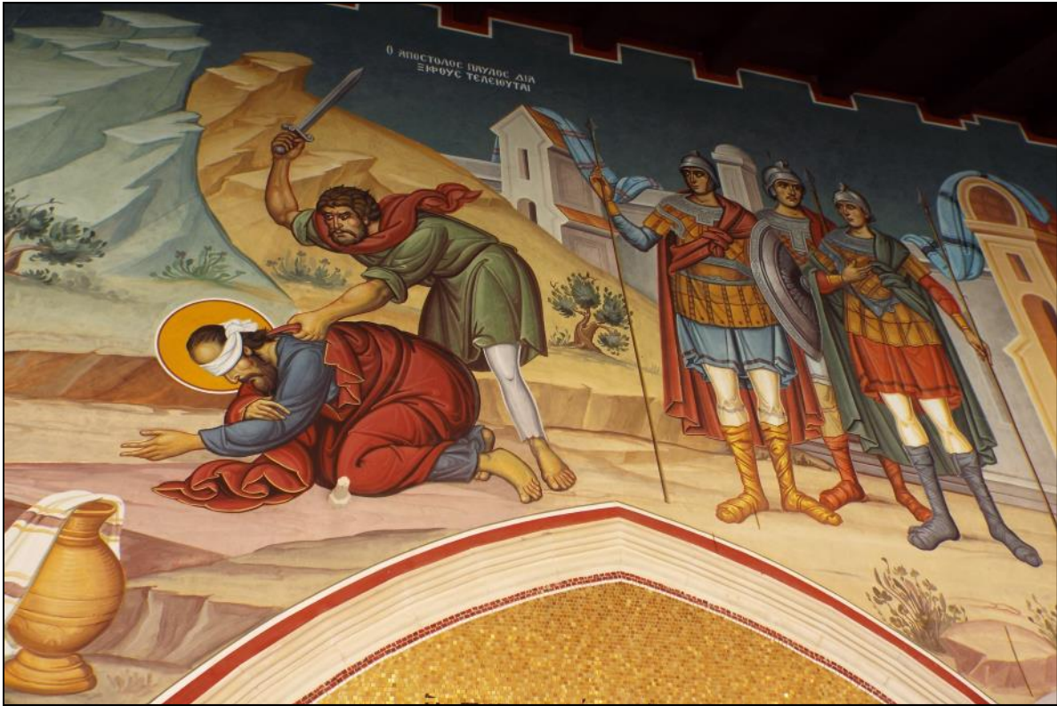
The Apostle Paul Beheaded by the Sword (Early Church Tradition)