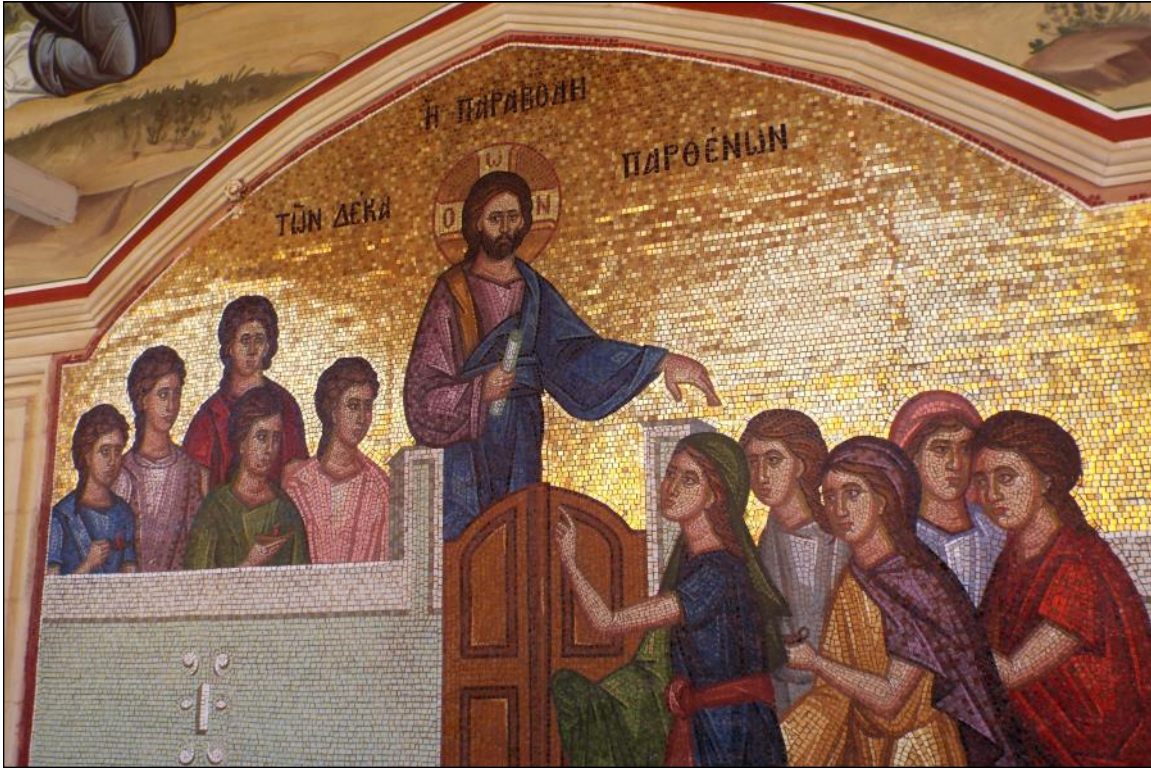
The Parable of the Ten Virgins (Mt. 25:1-13)