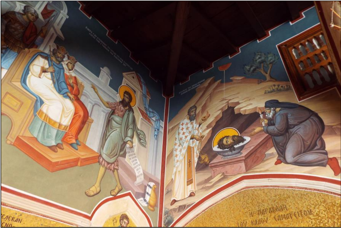
John the Baptist's Chastisement of Herod Antipas for Marrying Herodias, His Brother's Wife, Resulting in John's Head on a Platter (Mk. 6:14-29)