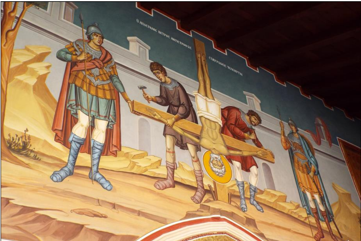
The Apostle Peter Crucified Upside Down (Early Church Tradition)