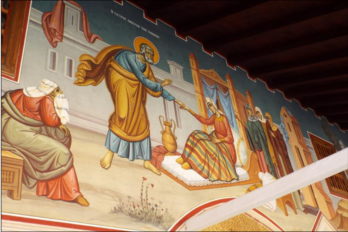
Peter Raises Tabitha Back to Life at Joppa (Acts 9:36-42)