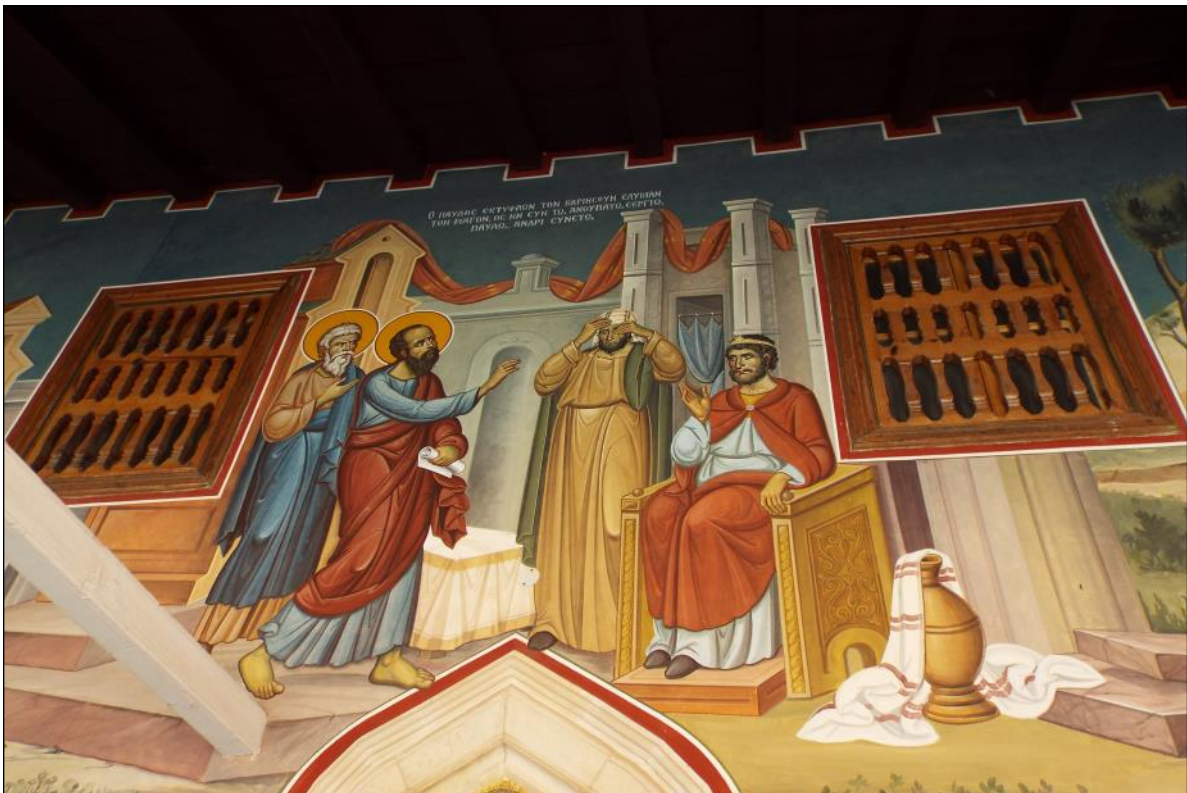
Paul Blinds Elymas Bar-Jesus, Who Was with the Proconsul Sergius Paulus at Paphos (Acts 13:6-12)