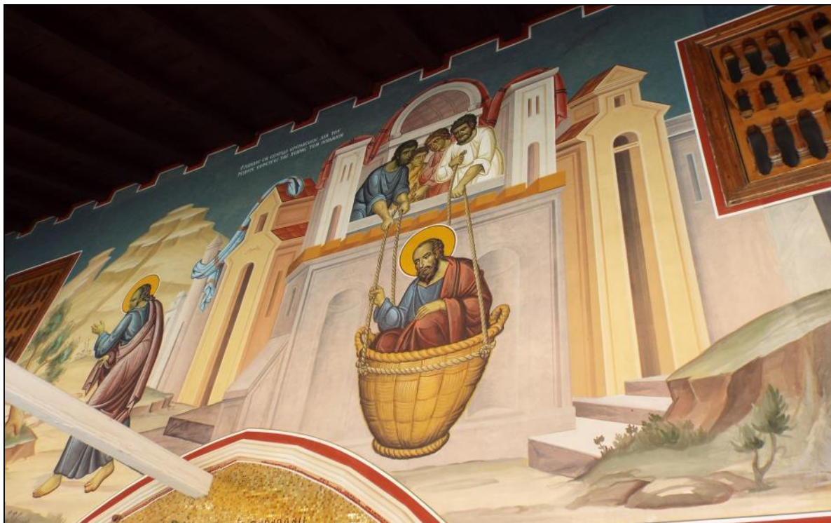
Paul's Being Lowered in a Basket from an Opening in the Damascus Wall (Acts 9:23-25)