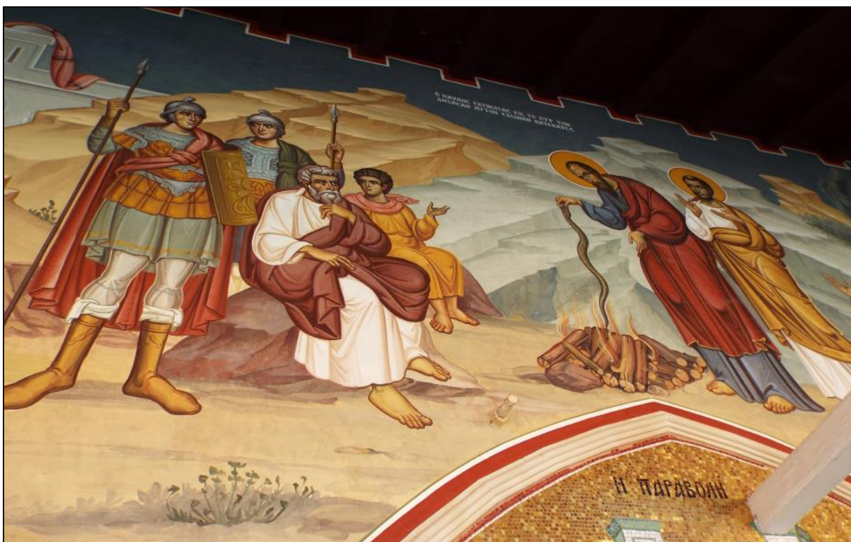
Paul Bitten by a Serpent at Malta (Acts 28:1-6)