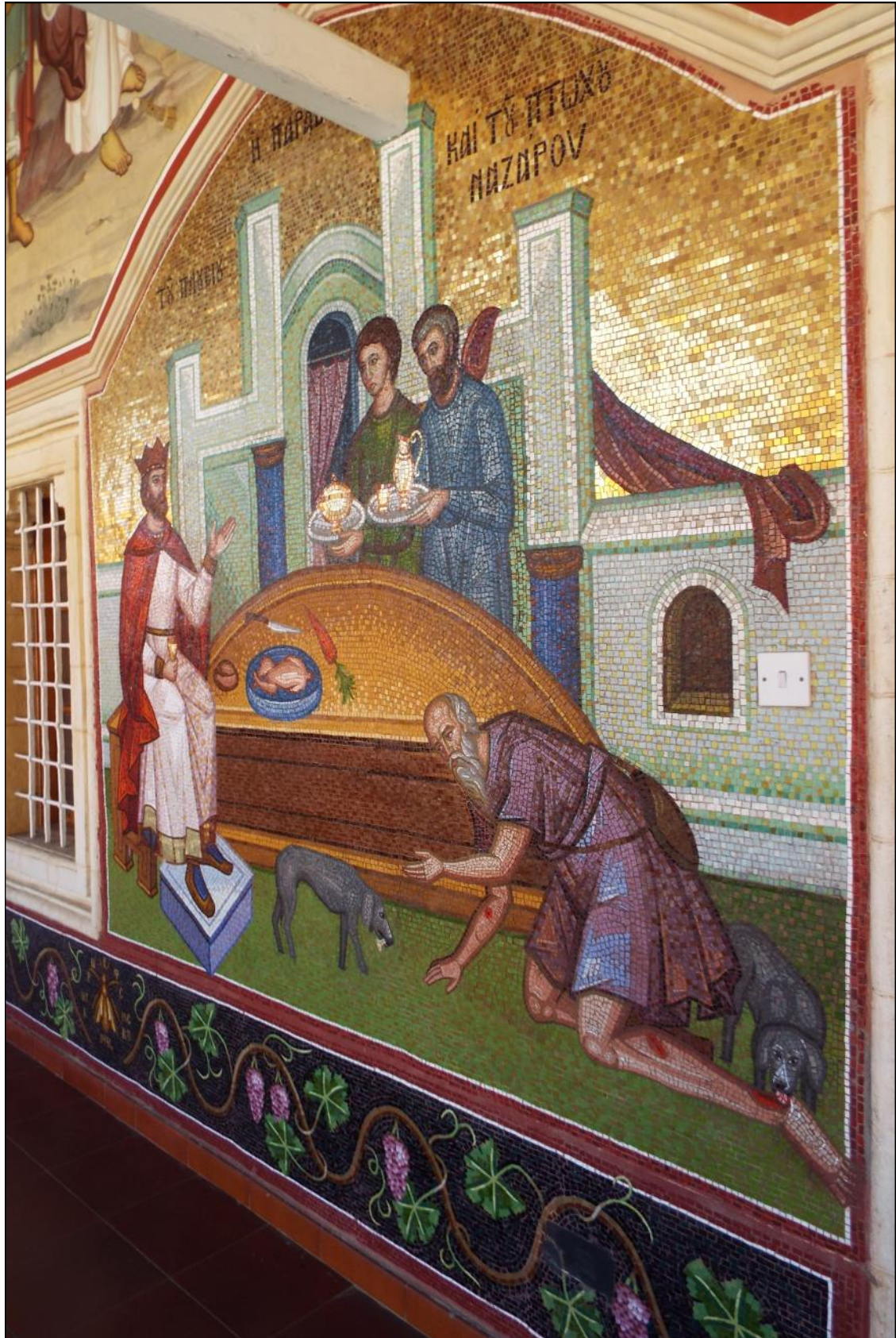
The Account of the Rich Man and Lazarus (Lk. 16:19-31)