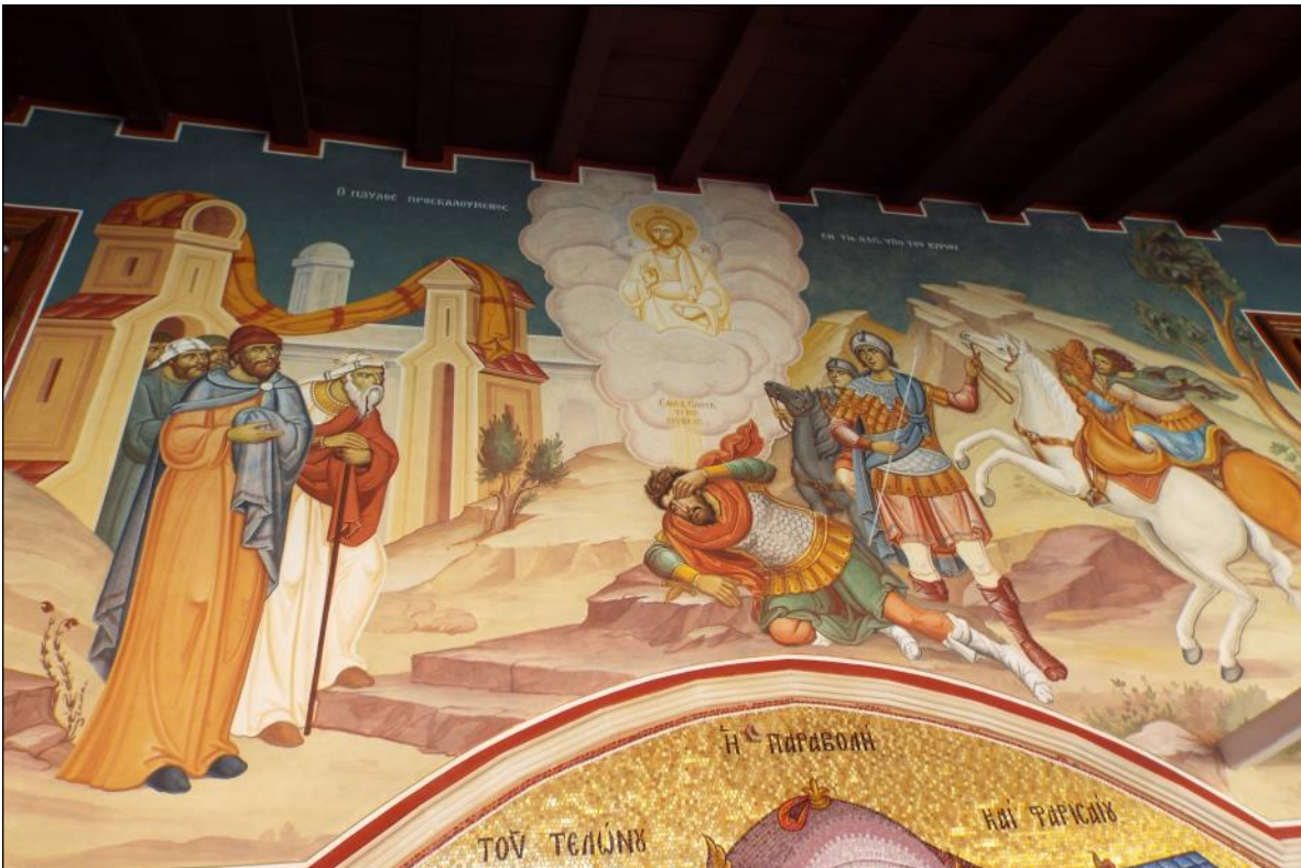
Paul's Vision of Christ on the Damascus Road (Acts 9:3-9)