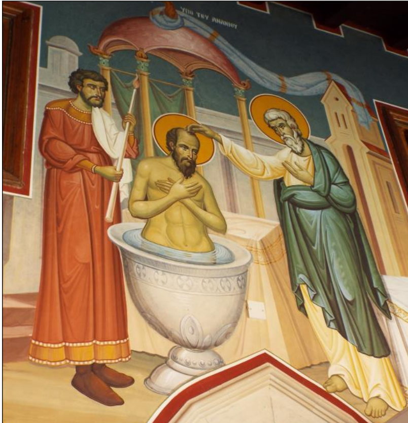
Paul's Being Immersed by Ananias (Acts 9:17-19; 22:12-16)