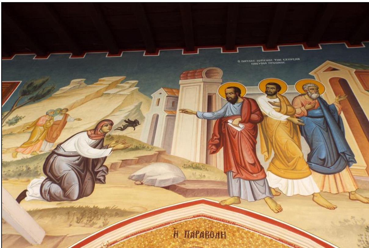
Paul Drives the Pythian Spirit from the Slave Girl at Philippi (Acts 16:16-18)