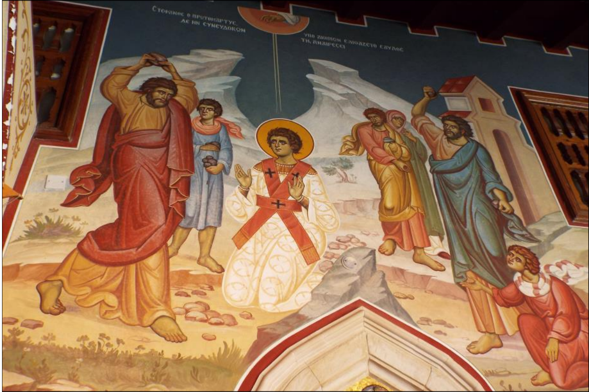
The Stoning of Stephen, the First Christian Martyr (Acts 7:58)